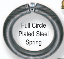
Full Circle Plated Steel Spring