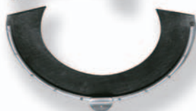
Half Circle Conductive Neoprene Brush

Electrode Connector: For spring electrodes the connector has a sealed ball bearing in the end to permit the electrode to roll freely. Simple wing nut connection for brush and other type electrodes.