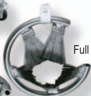
Full Circle Steel Brush