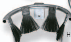
Half Circle Steel Brush