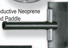
Conductive Neoprene Hand Paddle