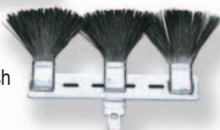
Flat Steel Brush